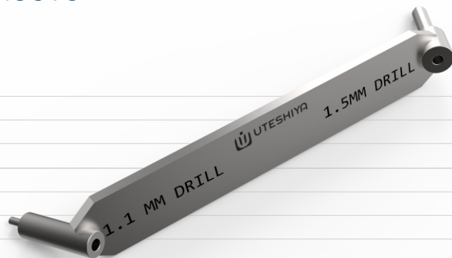
Plate Bending Pin